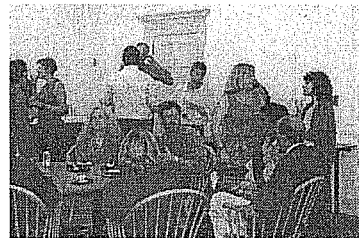
Pictured left, faculty celebrate the new year at the Welcome Back Social, held on Sept. 9.

Please feel free to drop by the AAUP office in Marcus White or to contact any member of the staff or Executive Committee to discuss your ideas or concerns. Best wishes for a productive year.